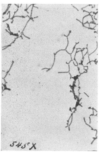
Fig. 2. Sporulation of Streptomyces bikiniensis

Habitat. Organisms isolated from a soil obtained from the island of Bikini, Bikini Atoll, in the northern Marshall Islands, during the Bikini bomb experiments in July, 1946. Soil pH 9.0.